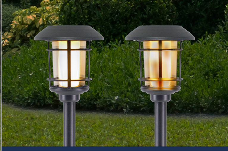
Modalità luce fissa o effetto fiamma Fixed light or flame effect mode