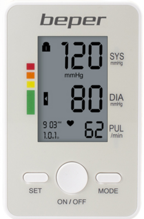
Misuratore di pressione da braccio