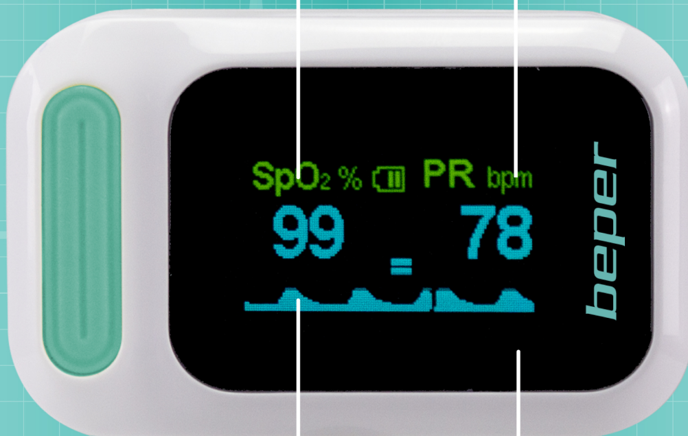
GRAFICO CURVA IMPULSO PULSE CURVE GRAPH