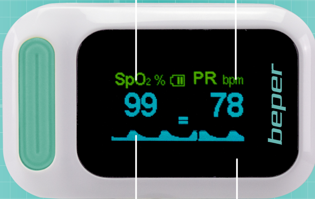
GRAFICO CURVA IMPULSO PULSE CURVE GRAPH